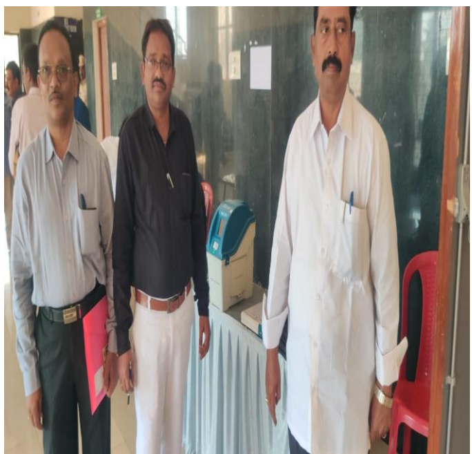
Attended Election training as ALMT at JNTU Auditorium, Ananthapur